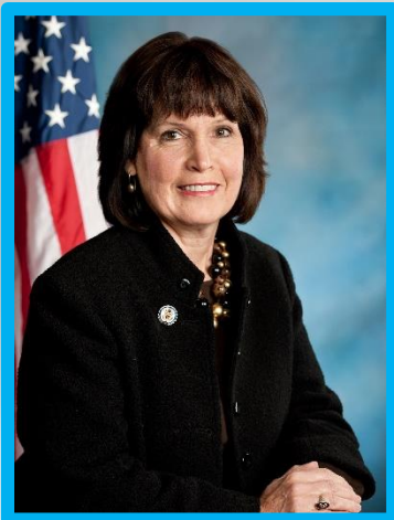
Congresswoman McCollum HAC-D (Vice Chair)