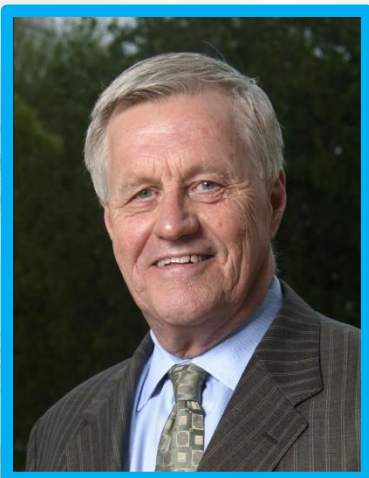
Congressman Peterson HVAC