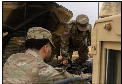
Texas Army National Guard conducts maintenance checks.