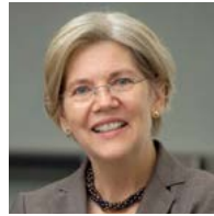
THE HONORABLE Elizabeth Warren U.S. Senator, Commonwealth of Massachusetts