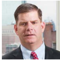
THE HONORABLE Martin J. Walsh Mayor, City of Boston