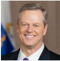
THE HONORABLE Charles D. Baker Governor, Commonwealth of Massachusetts