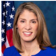
THE HONORABLE Lori Trahan U.S. Representative, 3rd Congressional District of Massachusetts