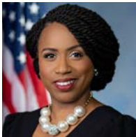
THE HONORABLE Ayanna Pressley U.S. Representative, 7th Congressional District of Massachusetts