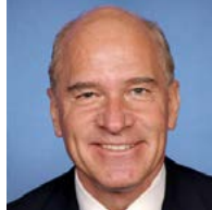
THE HONORABLE William R. Keating U.S. Representative, 9th Congressional District of Massachusetts