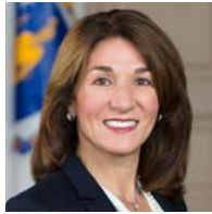
THE HONORABLE Karyn Polito Lieutenant Governor, Commonwealth of Massachusetts