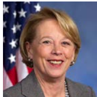
THE HONORABLE Niki Tsongas Fmr. U.S. Representative, 3rd Congressional District of Massachusetts