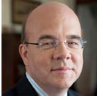
THE HONORABLE James P. McGovern U.S. Representative, 2nd Congressional District of Massachusetts