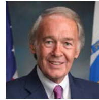
THE HONORABLE Edward J. Markey U.S. Senator, Commonwealth of Massachusetts