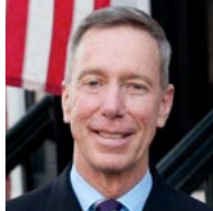
THE HONORABLE Stephen F. Lynch U.S. Representative, 8th Congressional District of Massachusetts