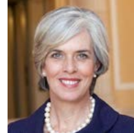
THE HONORABLE Katherine M. Clark U.S. Representative, 5th Congressional District of Massachusetts