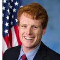
THE HONORABLE Joseph P. Kennedy III U.S. Representative, 4th Congressional District of Massachusetts