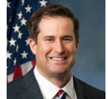
THE HONORABLE Seth Moulton U.S. Representative, 4th Congressional District of Massachusetts