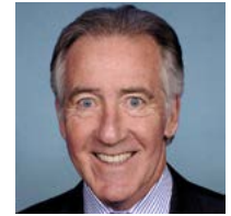
THE HONORABLE Richard E. Neal U.S. Representative, 1st Congressional District of Massachusetts