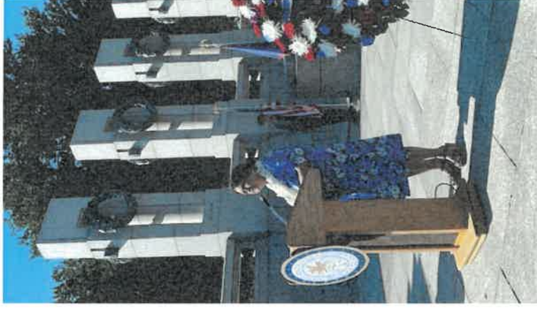
Governor Lourdes A. Leon Guerrero at the Guam Liberation Day Wreath-Laying Ceremony, Washington, D.C.