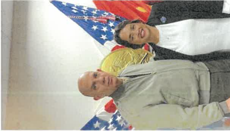
Governor Lourdes A. Leon Guerrero and General David H. Berger, Commandant of the Marine Corps