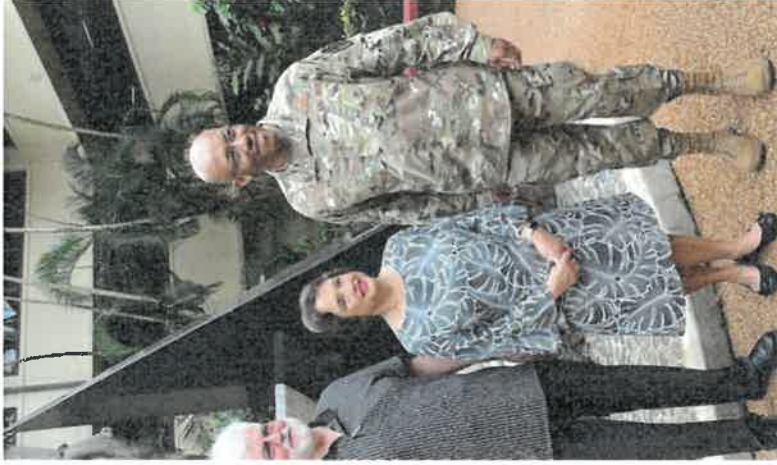
Governor Lourdes A. Leon Guerrero and General, Charles Q. Brown Jr., Chief of Staff of the Air Force